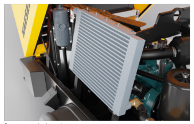
Compressed air aftercooler